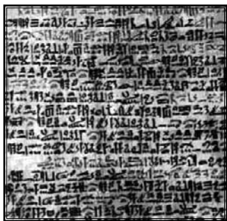
A fragment of Ebers Papyrus

The most complete medical documents existing are the Ebers Papyrus (1550 B.C.), a collection of 800 prescriptions, mentioning 700 drugs and the Edwin Smith Papyrus (1600 B.C.), which contains surgical instructions and formulas for cosmetics. The Kahun Medical Papyrus is the oldest—it comes from 1900 B.C. and deals with the health of women, including birthing instructions.