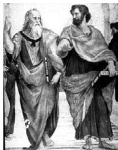
Aristotle and Plato