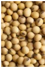
Genetically Altered Soybeans

resistant to pesticides and/or herbicides. They do this so that the crop fields can be sprayed with weed killer, and every plant will die other than the crops. Other benefits that GE crops can have are they are more nutritious for example, rice is a staple food for many countries but rice lacks vitamin A. In third world countries that normally only eat rice and cannot afford to get vitamin A rich foods suffer the affects of a lack of vitamin A. Some examples are people can get a condition that causes blindness, become more susceptible to diarrhea, respiratory infections and childhood diseases. So through genetic engineering, scientist found a way to introduce a rice produce with vitamin A. Some other things that GE crops can be engineered to do is, to be less susceptible to diseases, have the crops grow faster, extend the shelf life of crops, and make crops able to grow in unfavorable conditions.